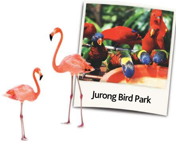
Jurong Bird Park