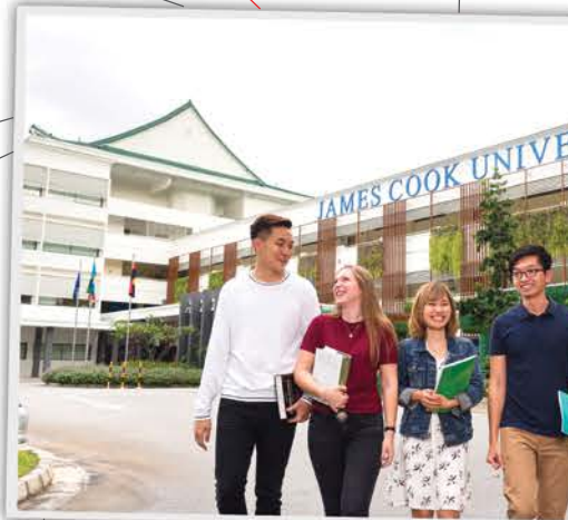
James Cook Unive